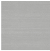
Satin Stainless Satin-SS