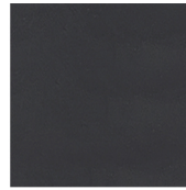
Flat Black PC-8