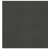
Oil Rubbed Bronze PC-65