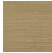
Satin Champagne TP-12